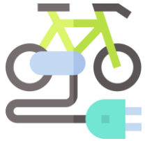
Transport & logistics

The roadmap is being developed in collaboration with 200+ local and regional stakeholders. Interventions are being mapped for five priority topics and six cross-cutting enablers.