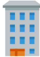
Buildings & construction